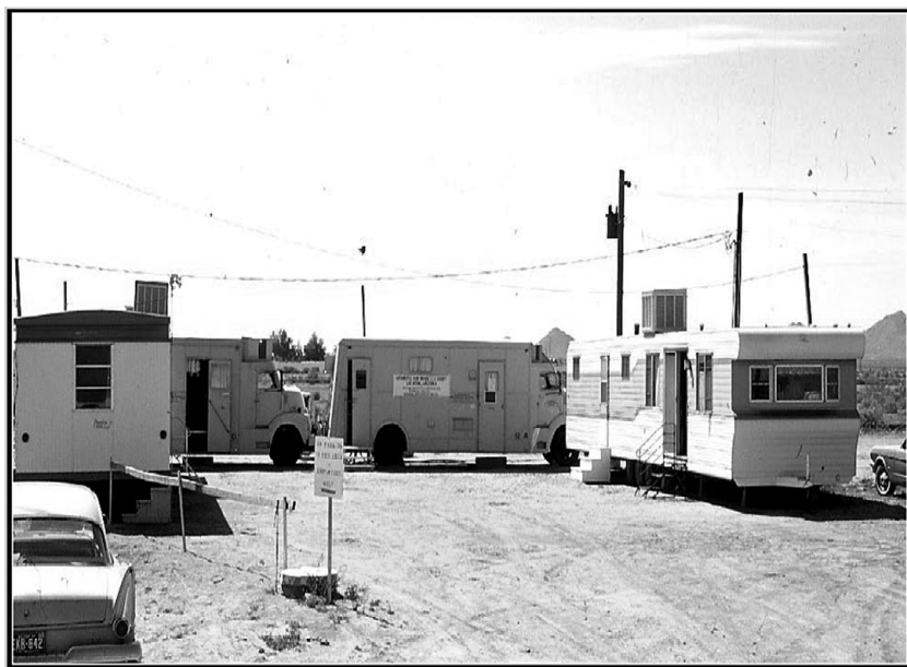
Figure 7.5 NIH trailers at data collection site, circa 1963.