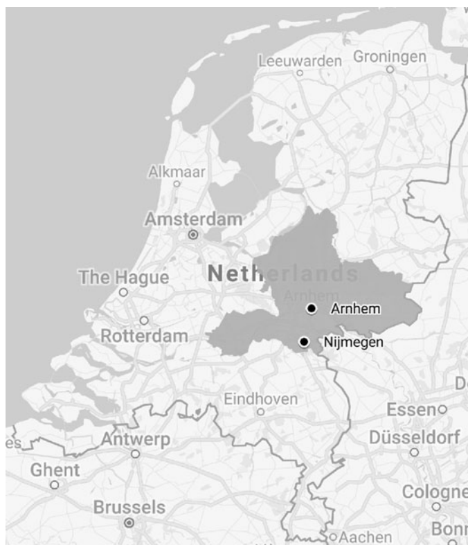
Figure 1: Map of Arnhem and Nijmegen within the province of Guelders

Their current demographic makeup is very similar: their populations' age distribution, average personal income, country of origin, as well as property prices, unemployment levels and crime figures are all comparable. 17 Both cities saw rapid urbanization after their relatively late industrialization at the turn of the twentieth century. 18 While Nijmegen has hosted a university since 1923, making it a comparatively well-educated city, Arnhem's inhabitants are currently relatively highly educated as well. Today, moreover, many people commute between Arnhem and Nijmegen, making it even harder to pinpoint major differences between the populations of the two cities.