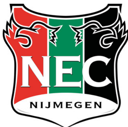
Figure 3: (Colour online) Top: the crests of Arnhem (left) and Nijmegen (right); bottom: the emblems of Vitesse (left) and NEC (right)

their rivalry, many twenty-first-century books and articles mention the clubs as well. 113