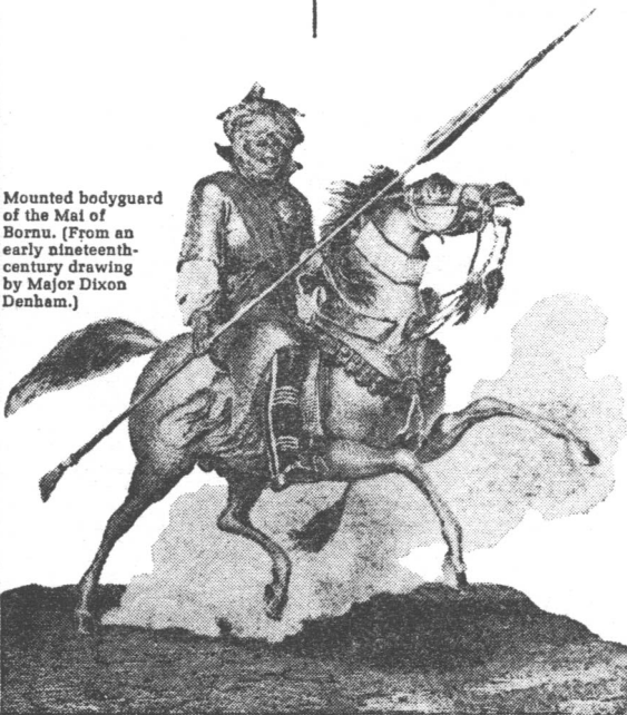
Mounted bodyguard of the Mai of Bornu. (From an early nineteenth-century drawing by Major Dixon Denham.)