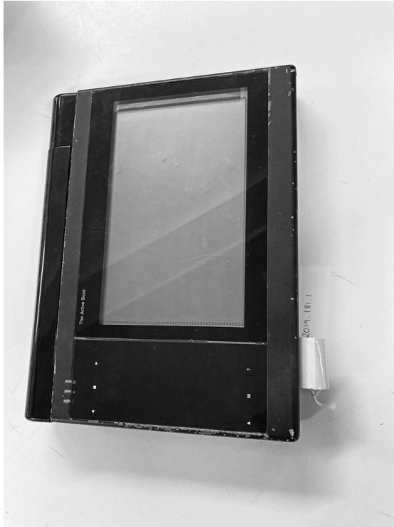
Figure 1.1 Active Book prototype, courtesy the Centre for Computing History (exhibit reference ID CH53902).

address (and resolve to their advantage) my student's question: whether an e-book counts . Drucker noted in 2003 how the most inflated millennium marketing claims promising 'the expanded book, the super-book, the hyper-book' deflated along with the companies that made them, fading from use as (sometimes visionary) devices and platforms failed to win audiences or deliver on their bold promises. 93 Realness is now more often framed in terms of equality with, not superiority to, print. E-reading device and e-book retailers are not only emphatic but also careful in their use of the word 'real' in marketing messages and product descriptions, deploying it strategically to describe discrete aspects of e-books as well as the books themselves. One example is how, when announcing the device launch of the second-generation Kindle, Amazon promoted its display technology as using 'real ink', but on an 'electronic paper display' that