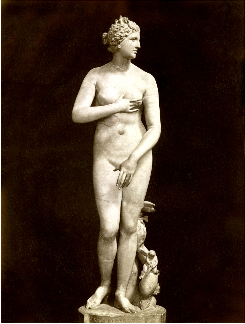
Figure 1.1 Venus de' Medici . First-century BCE copy of a fourth-century BCE statue. Uffizi Gallery, Florence, Italy.