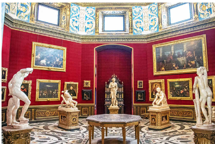
Figure 1.2 Bernardo Buontalenti, The Tribuna (1581–1583). The Wrestlers (deep left); Venus de' Medici (center); The Listening Slave (deep right). The Uffizi Gallery, Florence, Italy.

example of proportion, taken on tours in travel guides as a standard of excellence, and insistently included in novels and poems. 16