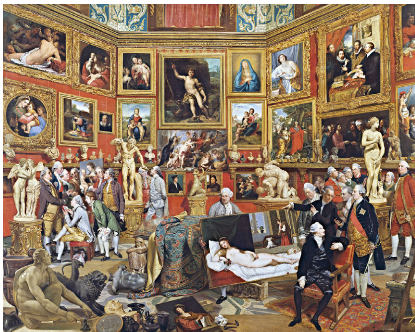
Figure 1.3 Johann Zoffany, The Tribuna of the Uffizi (1780).

composition that recreates some tourists' sense of being overwhelmed by the "folds within folds" as artistic styles and genres become close neighbors, and visiting connoisseurs crowd tightly in this aesthetic cul-de-sac . Millar interprets the painting as "a mixture of indefatigable industry, cupidity, self-seeking and imagination." 33 Rather than a literal depiction, Zoffany's Tribuna was, in Wolfgang Ernst's words, "a marvelous misreflection." 34 And yet The Morning Chronicle wrote in 1780 that "this