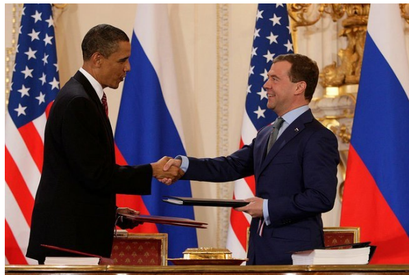
Barack Obama and Dmitry Medvedev after signing the “New Start Treaty in Prague in April 2010

President Obama in 2013 announced the possibility of further reductions of “deployed strategic nuclear weapons by up to one-third,” i.e., down to 1000–1100 weapons, ideally in negotiated cuts with Russia. 3 This language left open the possibility for unilateral cuts. It is worth recalling that, in 2000, President Putin had offered to cut to 1,000–1,500 warheads for each side, but U.S. President Clinton rejected it at the time. 4