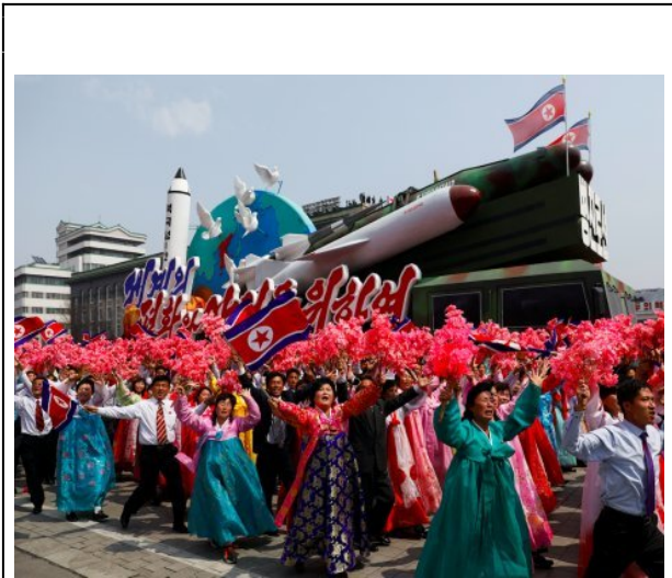
The Military Parade in Pyongyang, North Korea. April 2017

Secretary of State Rex Tillerson has declared that with regard to North Korea "the policy of strategic patience has ended. We are exploring a new range of diplomatic, security, and economic measures. All options are on the table." 49 Tillerson explained that this includes the use of force: "Certainly, we do not want to—for things to get to a military conflict. [...] If [the North Koreans] elevate the threat of their weapons program to a level that we believe requires action, that option is on the table."