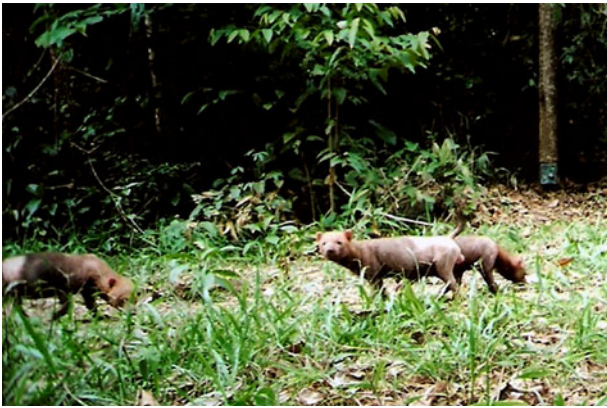
PLATE 1 A bush dog Speothos venaticus pack at the disturbed and fragmented study site of Alta Floresta, Brazil (Fig. 1).