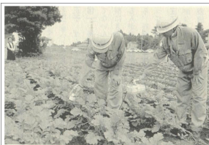
Figure 2: Officials monitor radiation levels at a radish field, 1km away from the Tokaimura plant (12.2.1999)

The nuclear disaster that Hayashi depicts in Harvest through the Tokaimura incident of 1999 takes on new meaning following the 2011 nuclear meltdown at the TEPCO-operated nuclear power plant in Fukushima. The dangers of nuclear power and people’s complacency in assuming that it is safe, as well as authorities and the media withholding information, are directly confronted in From Trinity to Trinity , Harvest and other works in Human Experience Over a Long Time .