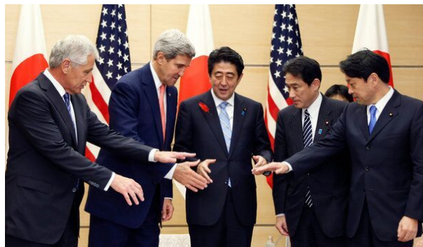
Choreographing Closer US-Japan Security Ties 2015

Hill revise its description of the comfort women in an American history textbook (Fackler 2015). This provoked a public relations disaster for Japan and publication of a letter by a group of US-based historians (including eminent scholars such as Carol Gluck and Sheldon Garon) expressing “dismay at recent attempts by the Japanese government to suppress statements in history textbooks both in Japan and elsewhere about the euphemistically named ‘comfort women’ who suffered under a brutal system of sexual exploitation in the service of the Japanese imperial army during World War II” in the newsmagazine of the American Historical Association (Dudden et al. 2015, 33). Since the U.S. government remains firmly opposed to revision of the Kono Statement, Abe and his supporters have conducted hit-and-run attacks against it in the Diet to discredit this mea culpa while denouncing the 1996 UN Coomaraswamy Report on “comfort women” (UN Commission of Human Rights 1996). Revisionists are thus waging a campaign to deny that Japan was responsible for forced recruitment of young women and that the “comfort women” system constituted sexual slavery, again tarnishing the dignity of the nation and its victims.