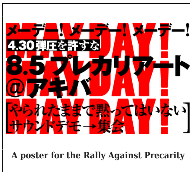
A poster for the Rally Against Precarity

precarity hit the lower strata of society and youth especially hard, leading to increased suicide, divorce, non-marriage, deflation and lower productivity because firms no longer invest in training disposable workers. In this acute social crisis, political leaders sought to divert attention to “external enemies.”