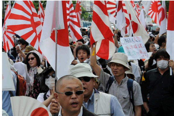
Zaitokukai Demonstrations Target ethnic Koreans in Japan

persistently exhibit hate messages targeting these two nations.