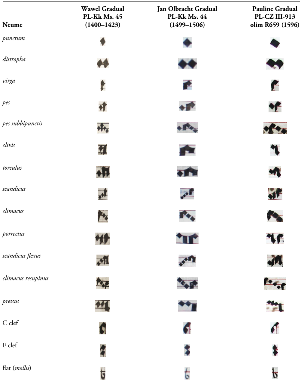
TABLE 1. NEUMES USED IN THE WAWEL GRADUAL, THE JAN OLBRACHT GRADUAL AND THE PAULINE GRADUAL