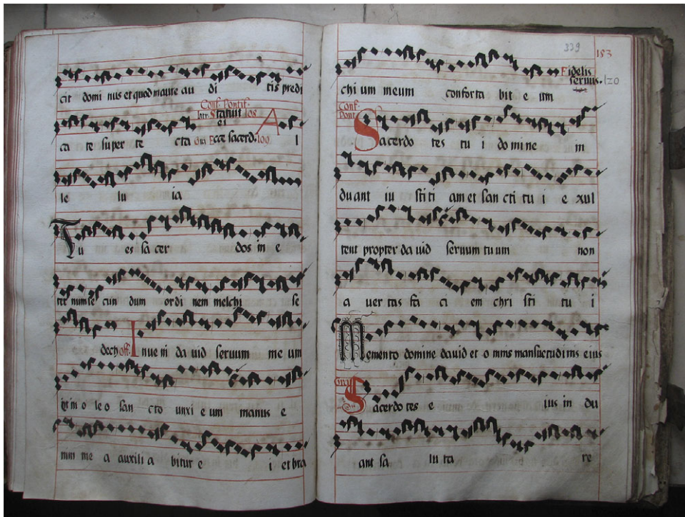
Figure 2. ‘Tu es sacerdos in aeternum’ in Pauline Gradual PL-CZ III-913 olim R659 (variant 2, fol. 152 v ) © The Main Archive of the Pauline Order at Jasna Góra.

C clef on the third line without notating a flat. Figures 1–4 illustrate the first alleluiatic verse in each gradual. 42