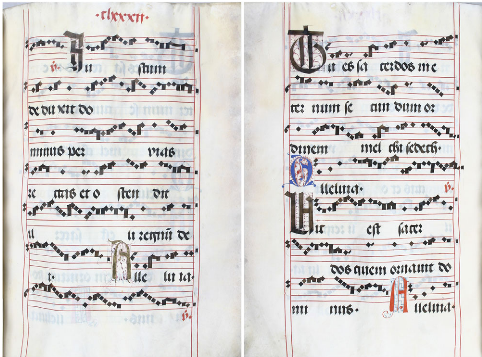
Figure 3. ‘Tu es sacerdos in aeternum’ in Jan Olbracht’s Gradual PL-Kk Ms. 44 (fol. 236 r )