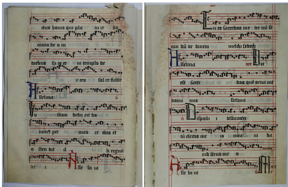
Figure 4. ‘Tu es sacerdos in aeternum’ in Wavel Gradual PL-Kk Ms. 45 (fol. 6 v -7 r ) © The Archives and Library of the Cracow Cathedral Chapter.