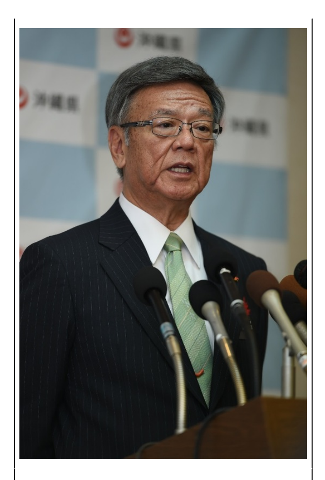
Governor Onaga on Assumption of Office, 10 December 2014

A certain ambiguity also arose at this time over Onaga's own stance. The Onaga who in his public persona as candidate had spoken of his determination "to stop [Henoko] construction using every means at my disposal,"18 and to rid Okinawa of the Osprey, 19 was shown to have adopted a much more flexible tone in confidential negotiations early in 2013. He had then put his name to a document with the mayor of Ishigaki City, Nakayama Yoshitaka, in which Nakayama stated that he did not rule out construction of a replacement base within Okinawa. It was only after this that Nakayama agreed to sign the Kempakusho agreement (Kempakusho being the fundamental statement of Okinawan demand for cancelation of Henoko