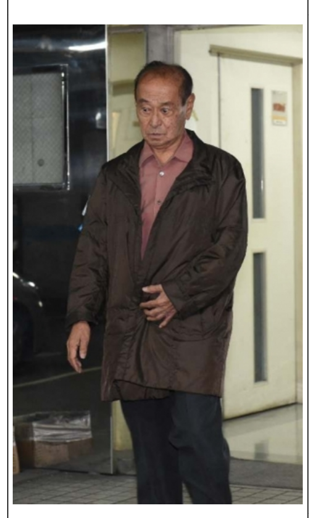
Governor Nakaima evades protesting Okinawan citizens by leaving his office by the back stairs, two days before departing permanently, 8 December 2014

Okinawan prefecture so that the file on Onaga's desk when he took office was known as the "Fifth Question." <sup>8</sup>