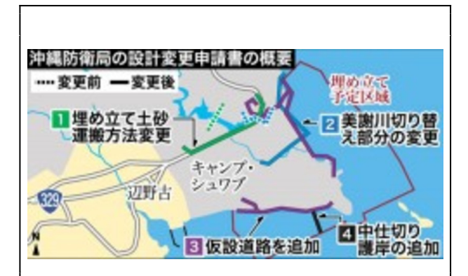
Four Major Changes sought by the Okinawa Defense Bureau in September 2014 to the December 2013 Henoko Plan.

kind of "Guantanamo" within an Okinawan "Cuba."