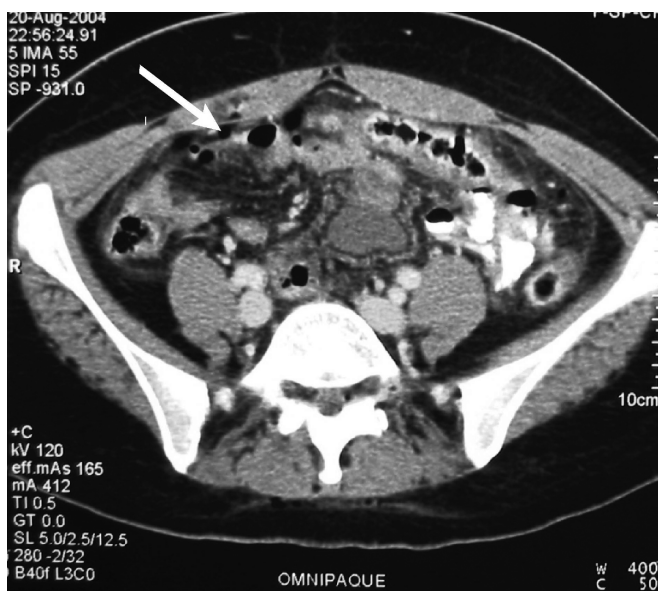
Figure 2: Axial CT image. Nonspecific large bowel wall thickening, and free intra-peritoneal air (white arrow), with slight peripheral enhancement.

With the recent advent of tubular retractor systems for lumbar microdiscectomy, an increasing number of spine surgeons are changing from the standard "open" microdiscectomy to this more minimally invasive approach. This case report represents