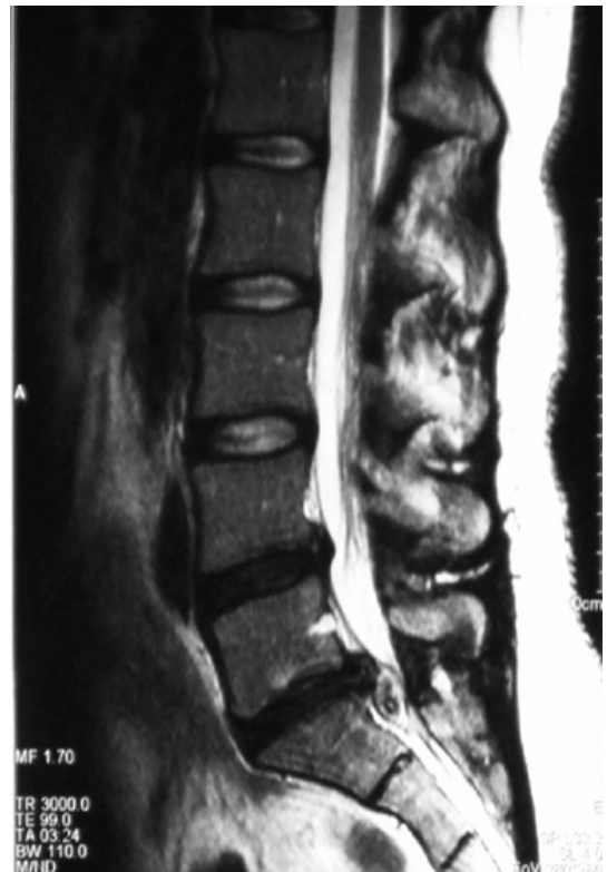
Figure 1a: Sagittal T2 MRI image of lumbar spine. Large disc herniation at L5-S1 is noted with sequestered disc material inferiorly.

Under general anesthesia, the patient was placed prone on the Wilson frame. Using fluoroscopy, a Kirschner wire was docked onto the right side of the L5 lamina and a 1.5cm skin incision was made. The METRx tubular retractor was then introduced in standard fashion over sequential dilators and the microscope brought in. Following laminotomy and removal of ligamentum flavum, the anticipated large disc herniation distorting the S1 nerve root was encountered. The disc was incised, and the