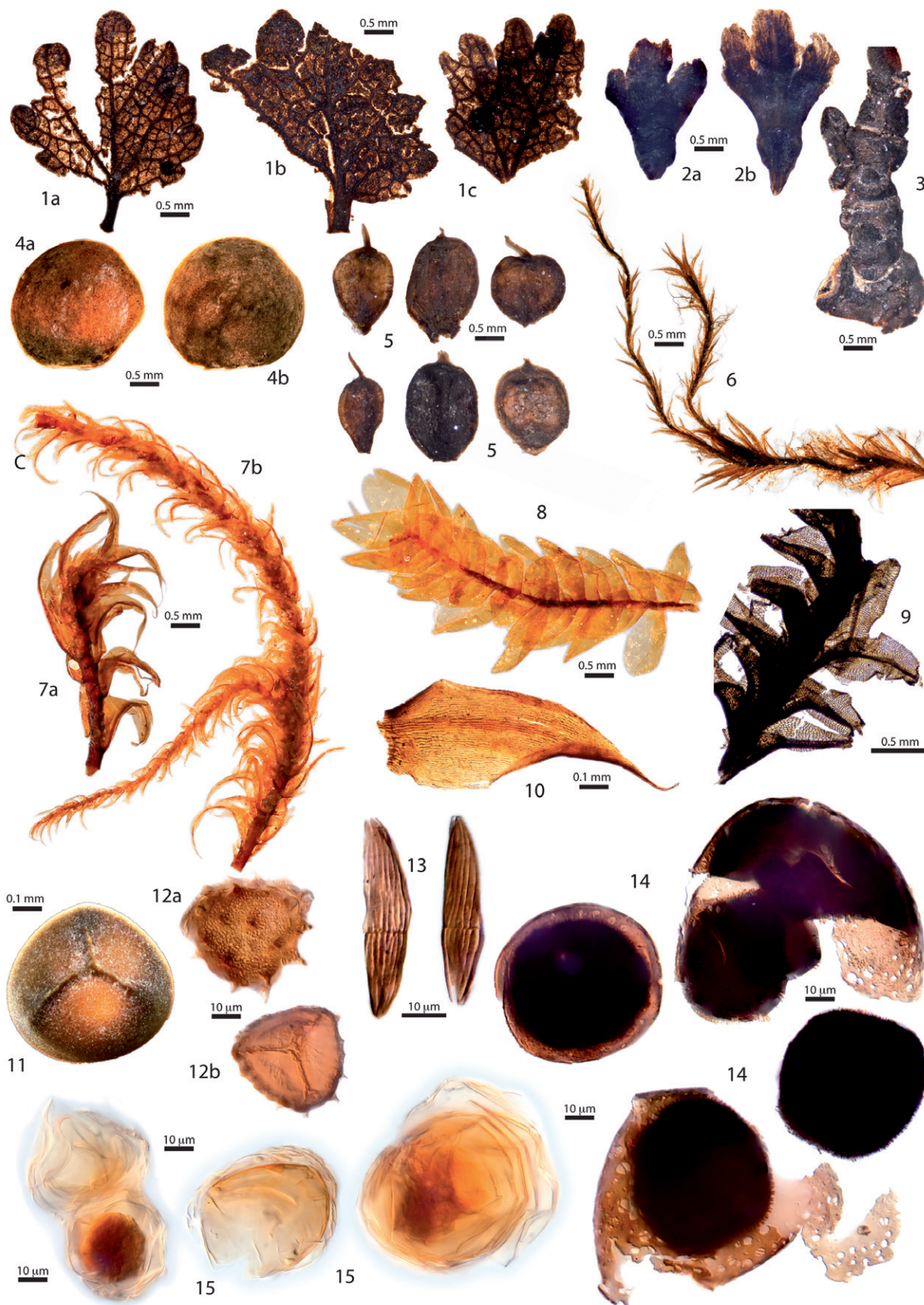
Plate 1. Selected macroremains and microfossils and some newly distinguished microfossils from site Wageningen-Forum. 1a-1c. Leaf fragments of Betula nana ; 2a-b. Female catkin scales of Betula nana ; 3. Twig of Salix sp. showing axillary buds and leaf scars; 4a-b. Seeds of Menyanthes trifoliata ; 5. Carex sp.; 6. Ceratodon purpureus ; 7a-b. Scorpidium revolvens ; 8. Calliergonella cuspidata ; 9. Meesia triquetra ; 10. Leptodictyum riparium ; 11. Macrospore of Selaginella selaginoides ; 12a-b. Microspores of S. selaginoides ; 13. Type HdV-1400 spores; 14. Type HdV-1401 microfossils; 15. Type HdV-1402 microfossils.