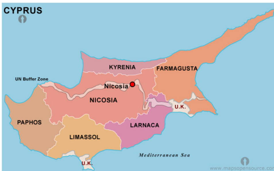
Figure 1. Map of Cyprus

there is not. Buschfeld also examines the status that English has in Cyprus today and claims that it ‘can neither be categorized as a second-language variety (ESL), nor as a typical learner English (EFL)’ (p. 11). She argues that at the moment English in Cyprus is undergoing a ‘reversal from ESL to EFL status’ (ibid.). However, in another study on the status of English in Cyprus, Tsiplakou (2009) claims that ‘the historical evidence strongly