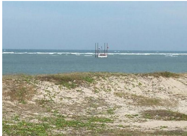
The first nuclear power plant will be built on this site in Ninh Thuan Province in southeastern Vietnam

According to the plan, by 2014, all residents of the village will be relocated two kilometers away and the village will become a nuclear power plant village. He too will have to part with his grape fields, which he must have cared for painstakingly. “They say that they will give us substitute farms in the area we relocate to. No one is delighted to leave the village, but it can’t be helped as it’s for the development of the country.”