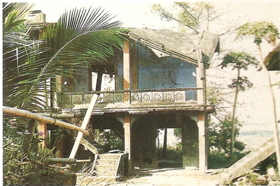
Local farmers at Phnom Chisor in 1988 pointed out what they said was 1973 U.S. bomb damage to the historic site's modern Buddhist wat, still unrepaired in 1988.

First, the CACTA database, High wrote, “contains the field ‘LoadQuantity’ which is composed of [three parts, namely] load delivered, jettisoned and returned. We made a sum of jettisoned and returned[,] to calculate how many bombs were dropped. It also has a field labelled ‘Load Weight’. This lists the weight of each bomb, not the total of the load. It also has a field ‘number of aircraft’. We determined that the load quantity referred to the total of all the aircraft, not each one.”