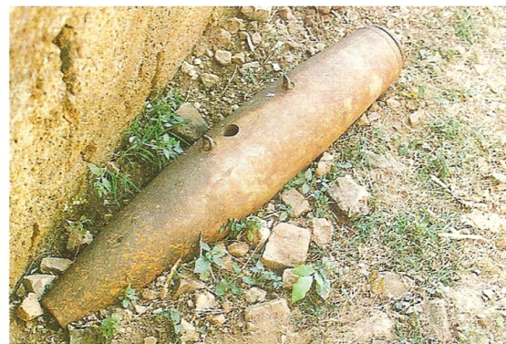
In 1988, farmers at Phnom Chisor pointed to an unexploded U.S. bomb still lying where it had fallen in 1973.

This is a valuable insight into the nature of the database and the thoughtful analysis that High, Curran and Robinson have conducted. But it is simply a window into the process. We do not have access to the details of the process that they used to build their database, nor to the complete database on which they have made these final calculations. Without further information we do not know, for instance, why a zero erroneously added to each bombing load weight could have produced an approximately fivefold tonnage over-estimate (from c. 0.5 to 2.7 million tons), rather than a tenfold error. But we do have here a glimpse into some of the process of the data analysis that it would be valuable to have fully entered into the public record. This would allow us to compare the database they built with the one we used for our analysis, which to the best of our knowledge are similar in structure. To get this important historical analysis right, we ask High and her colleagues to release their database and more fully explain the process by which they created it from the Pentagon’s original files.