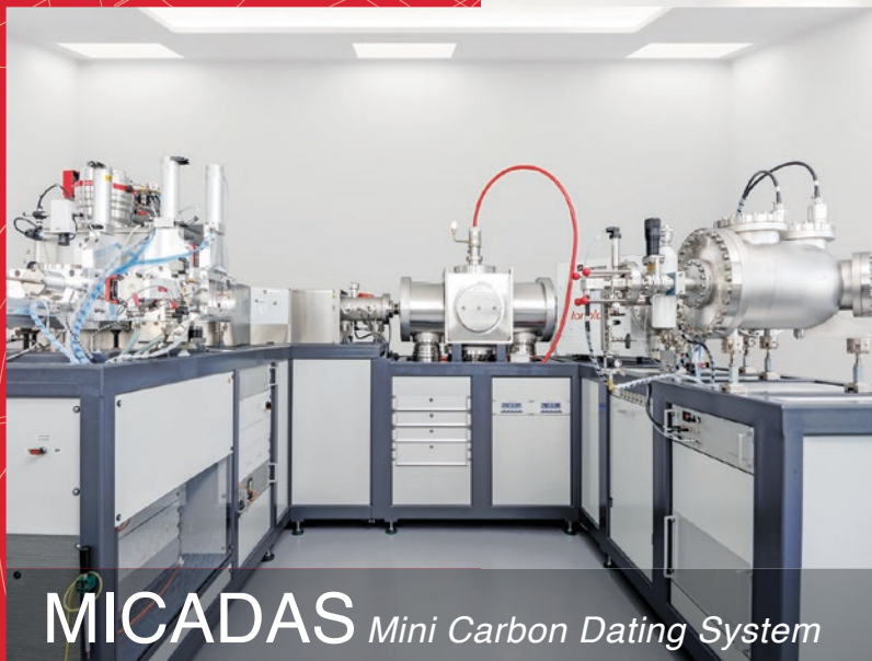
MICADAS Mini Carbon Dating System

Scientific Instruments for Radiocarbon Dating and Accelerator Mass Spectrometry