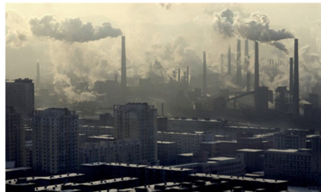
China coal-fueled steel production at Benxi

dioxide. Burning coal releases massive amounts of mercury and other pollutants into the environment. Clean coal technology in power production is not going to remove these pollutants. Theoretically of course, it is possible to develop all kinds of apparatuses to remove these pollutants from the emission stream of coal combustion. But the more one removes pollutants and particulates from the emission stream, the more costly is coal-fired power per kilowatt hour. Coal’s only strong points are that it is cheap, is already a major source of power, and there are plentiful reserves outside the OPEC countries. Raise its per kilowatt-hour cost, and it loses its main advantage to the truly clean energy sources, notably wind and solar, that are already at or close to grid parity (equivalent per kilowatt-hour generation cost) with it.