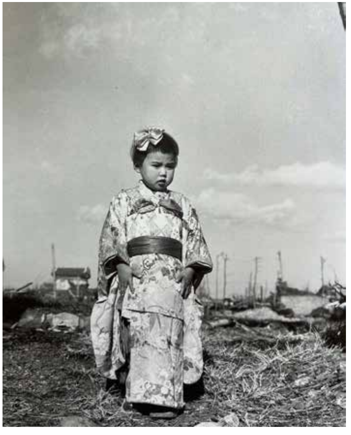
Figure 12. Dressed Up Little Girl

The chapter ends with a series of photographs of churches, bringing the reader full circle to the religious imagery that opened the book. However, these dark, haunting photographs are the antithesis of the American priest in his white robes surrounded by U.S. Marines that opened the book (figure 4). One photo of the Urakami Cathedral shows the church sitting on a hill in the background, an expanse of debris extending between the viewer and the church (figure 13). Ominous clouds push down on the cathedral from above, casting it and the surrounding landscape in somber shadows. Two Japanese citizens stand under the eaves of a shack in the middle of the frame, their forms nearly invisible in the ravaged landscape. Religious imagery saturates the first and last photographs in the book. But whereas the first few photographs are filled with light—perhaps indicative of the belief in the just cause of the Occupation to reform a wartime enemy—the final photographs are so dark that they verge on the apocalyptic,