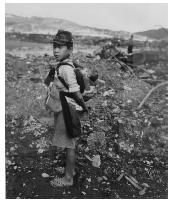
Figure 2. Body standing with baby brother among bombed ruins

The boy's upright posture and solid stance create a strong visual force that anchors the eye. He is slight and disheveled, surrounded by chaos, yet stands erect in a manner that allows him to rise above the ruins radiating around him.