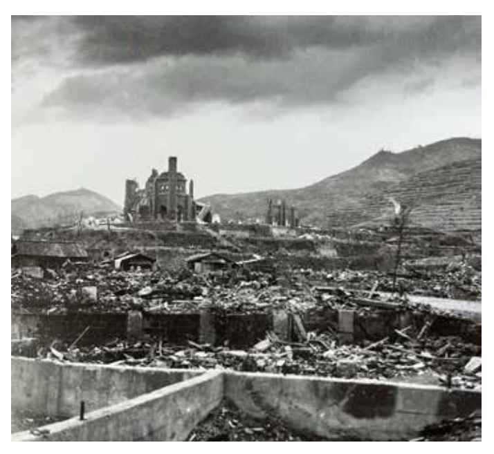
Figure 13. 'Calvary' in Nagasaki

The chapter ends with a series of photographs of churches, bringing the reader full circle to the religious imagery that opened the book. However, these dark, haunting photographs are the antithesis of the American priest in his white robes surrounded by U.S. Marines that opened the book (figure 4). One photo of the Urakami Cathedral shows the church sitting on a hill in the background, an expanse of debris extending between the viewer and the church (figure 13). Ominous clouds push down on the cathedral from above, casting it and the surrounding landscape in somber shadows. Two Japanese citizens stand under the eaves of a shack in the middle of the frame, their forms nearly invisible in the ravaged landscape. Religious imagery saturates the first and last photographs in the book. But whereas the first few photographs are filled with light—perhaps indicative of the belief in the just cause of the Occupation to reform a wartime enemy—the final photographs are so dark that they verge on the apocalyptic,