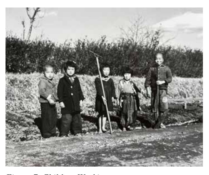
Figure 7. Children Working