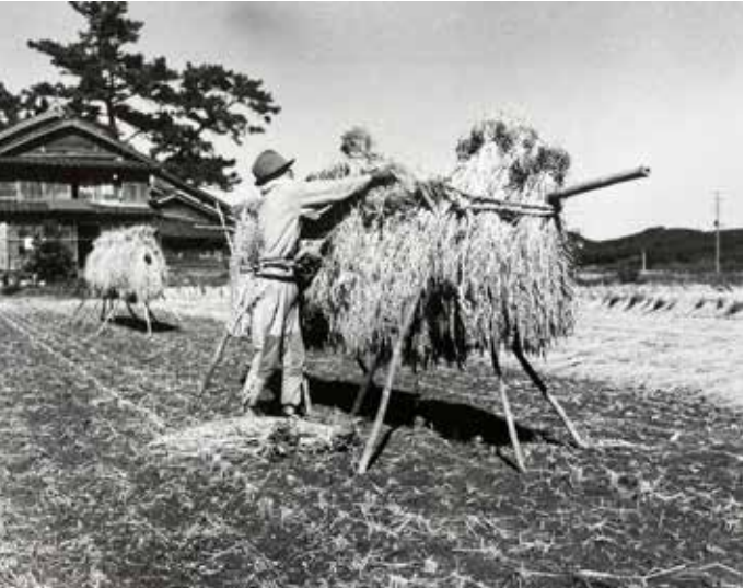
Figure 5. Rice Harvest

Tokyo was minimal, the raid had a tremendous psychological impact on Japan