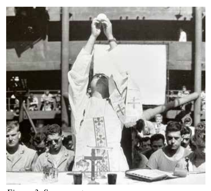
Figure 3. Sacrament

above his head and the afternoon sun sets his white robes ablaze, providing a contrast against the muted grays of the men and the battleship that fill the rest of the frame. Both photos are flooded with bright sunlight.