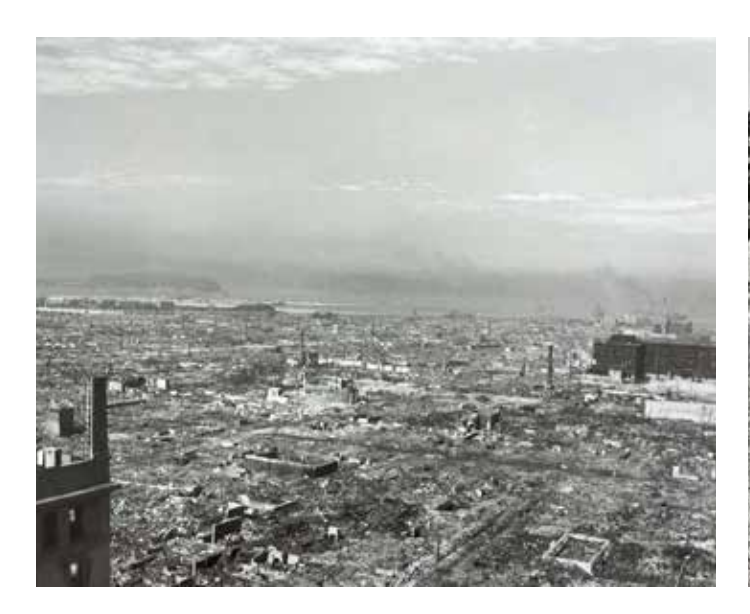
Figure 4c. Sasebo, Aerial View

trees. Families search for new places to live, carrying the few belongings they still owned. Women lug baskets full of rations, flanked by leveled buildings and blackened trees. Children swarm around a Marine sitting on the hood of his jeep, handing out chocolate and chewing gum to the hungry youth with outstretched hands. Quotidian moments punctuate these more somber scenes: young Japanese women hired as maids pose outside the Marine barracks in Sasebo, and a farmer harvests rice in a sunny field (figure 5).