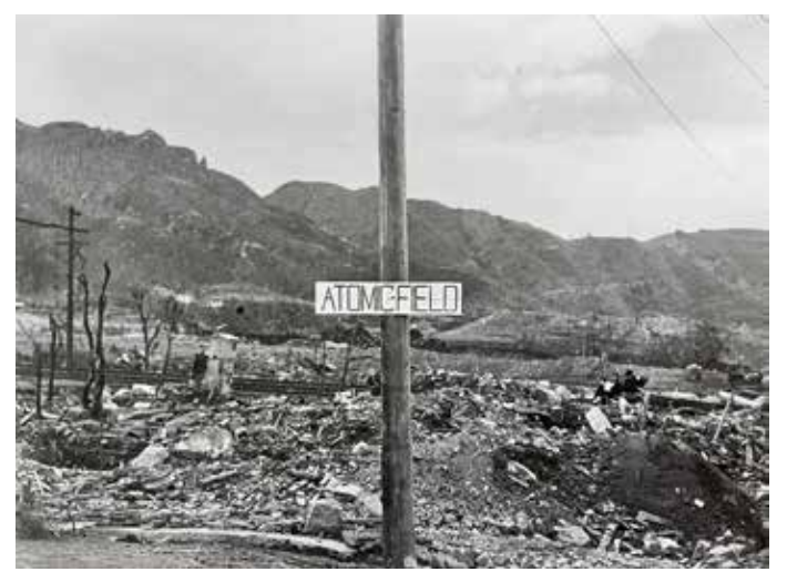
Figure 10. Atomic-Field

O'Donnell's narrative reaches a crescendo in the final chapter, assaulting the viewer with an unrelenting sequence of images of irradiated wasteland. The U.S. dropped the second atomic bomb on Nagasaki on 9 August 1945, killing between 40,000 and 70,000 people. In O'Donnell's photos, aerial views reveal the extent of the damage, while photos that he took on the ground place the viewer smack in the middle of the destruction. A few pages into the chapter, the viewer sees the landscape of Nagasaki up close (figure 10). One photograph focuses on a sign emblazoned with the words "ATOMIC-FIELD" posted amidst a landscape of shattered roof tiles, scorched wood, and crumbling concrete. Three Japanese civilians stand in the background on the right, almost lost among the sprawling detritus. They