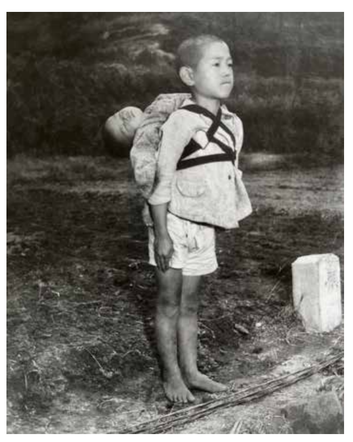
Figure 11. Cremation Site

O'Donnell only reluctantly turned his camera on those with severe physical wounds. In one photo that conveys in no uncertain terms the unimaginable physical suffering that he witnessed, O'Donnell captured a close-up of a boy's back, his burned flesh filled with maggots and oozing sores. In the caption, O'Donnell remembered the sickening smell as he helped to clear the maggots from the wounds. Horrified at the scene, O'Donnell vowed to never again photograph burn victims unless he received orders to do so. Even so, death and human suffering dominate the chapter on Nagasaki. One particularly heart-wrenching photograph shows a young boy standing at attention, his younger sibling strapped to his back (figure 11). At first glance, it appears that the toddler is merely sleeping. O'Donnell thought just this when he first spotted the pair, believing that the babe was snuggled safely on the back of his older brother. Soon, however, O'Donnell discovered the truth: