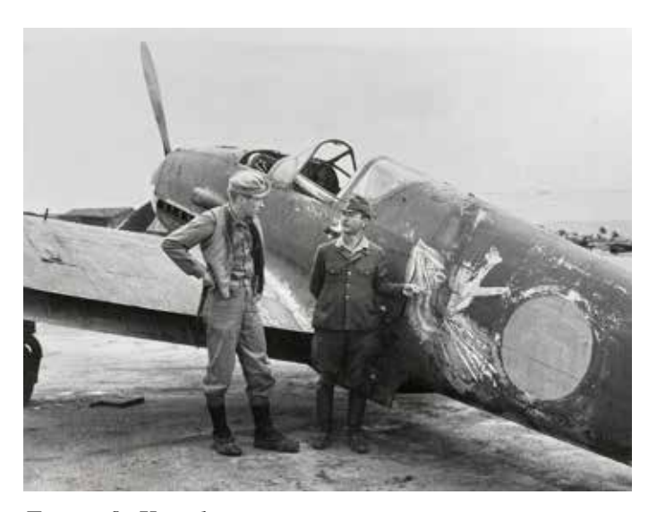
Figure 9. Kamikaze

In contrast to the mainstream American media, O'Donnell's photographs in Japan 1945 lacked any hint of lingering wartime animosities or portrayals of Japanese as hostile or mentally ill. In one photo, O'Donnell himself converses with a former kamikaze pilot instructor whose nineteen-year-old brother died in a suicide mission only days before Japan's surrender (figure 9). O'Donnell and the pilot appear at ease talking with one another. They stand next to the instructor's plane, which bears the image of a Japanese airplane attacking an American warship. One of the most intimate instances of cross-cultural exchange O'Donnell captured featured only inanimate objects: scuffed and muddy shoes lined up neatly in the genkan (entryway, where shoes are removed) of a local church. Rugged military boots have been placed side-by-side with Japanese-style shoes and geta sandals. "In a house of worship,"