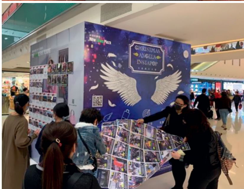
Figures 7 and 8 Lennon Walls being rebuilt

subject within an audience from the opposing group suggests both groups assumed that their messages were being read by the other. More importantly, when pairing the monologues of both channels, this use of language can be seen