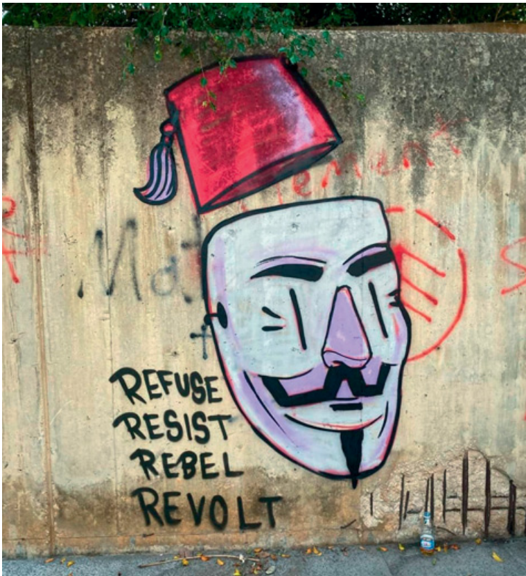
Figures 12 to 14 Guy Fawkes mask in Iraq, Lebanon, and Hong Kong