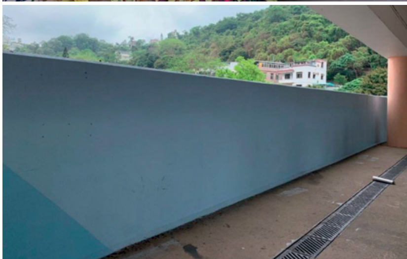
Figures 3 and 4 Space before and after censorship

for action. The prognostic, diagnostic, and mobilization frames used by both camps centered on similar topics such as what it means to be a Hong Konger, the meaning of the wall itself, and the sense of social order, morality, and justice. Each group attributed markedly different meanings to these concepts and their actions and devised alternate strategies and tips to implement their core principles.