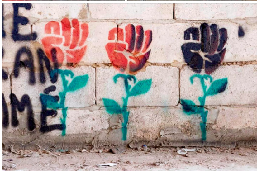
Figures 9 to 11 Fist symbols in Iraq, Lebanon, and Hong Kong

senders instead relied on the literacy of their audience in localized sociopolitical affairs. The assumption that “everyone knows” the wrongs of these bodies of institutional power reinforces the sense of a shared collective understanding and an imagined “we.”