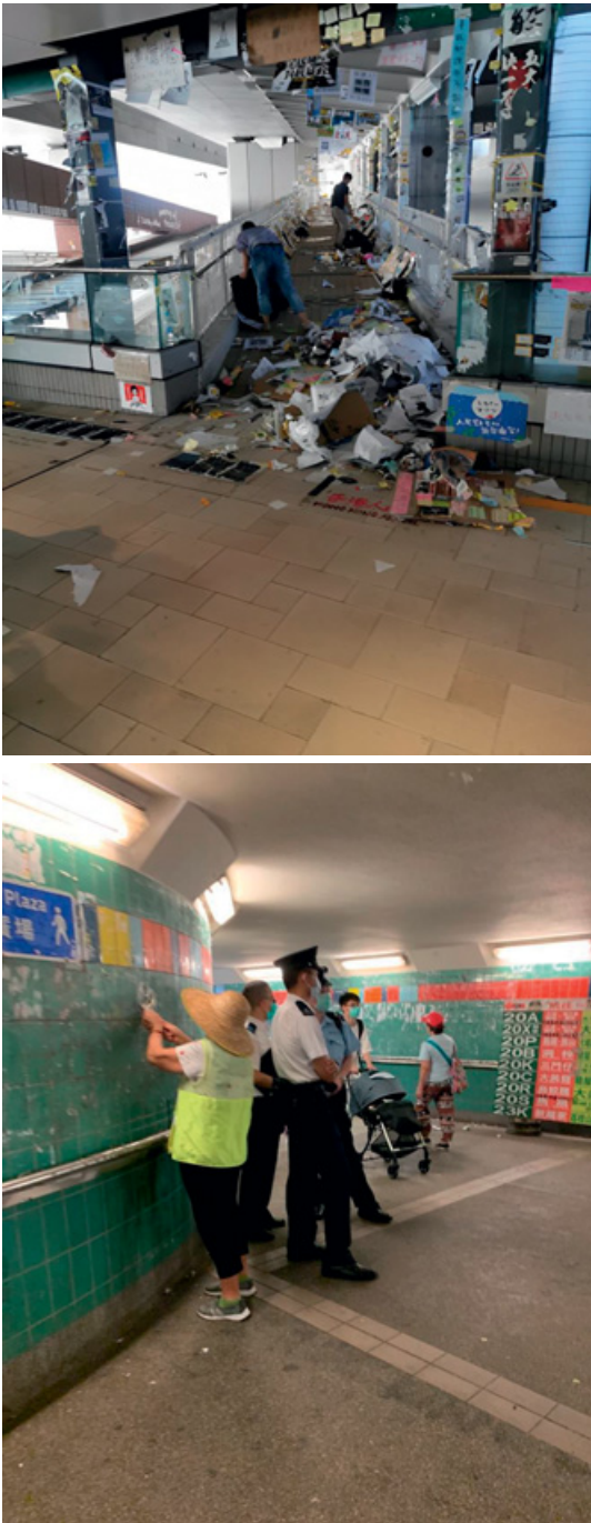
Figures 5 and 6 Lennon Walls being cleaned up