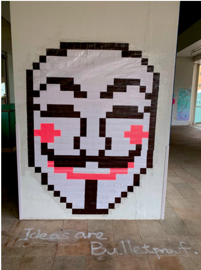
Figures 12 to 14 (cont.)

walls represent those neglected by the government and the need to protest against neoliberal policies and social inequalities (da Matta, 2020).