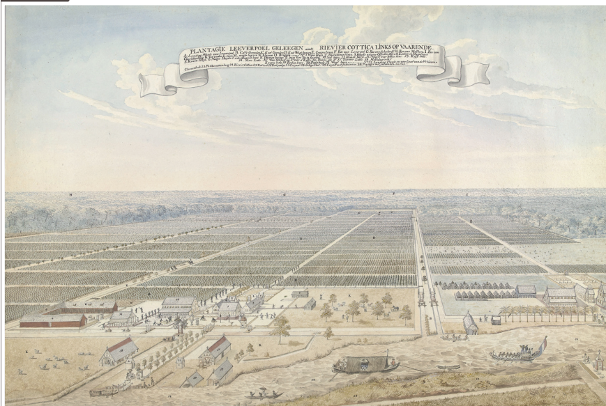
View of the coffee plantation Leeverpoel along the river Cottica in Suriname, around 1800. Anonymous artist. (Dutch title: Plantagie Leeverpoel Geleegen aan den Rievier Cottica links op vaarende ).

For further information: www.itinerario.nl