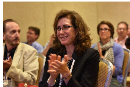
Below: Attendees applaud during the John Gaus Lecture.