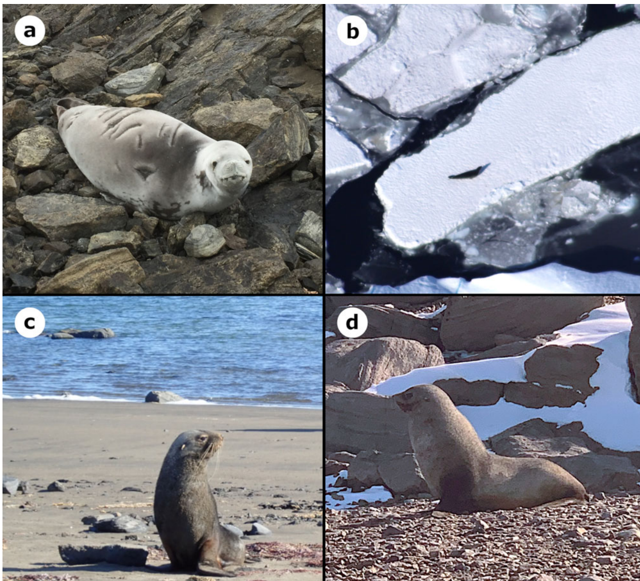
Figure 2. Incidental pinnipeds at the Vestfold Hills, East Antarctica. a. Crabeater seal ( Lobodon carcinophaga ) ashore at Heidemann Bay, 8 February 2019. Note the healed tooth rake marks indicating that this individual had escaped the jaws of a killer whale ( Orcinus orca ). b. Leopard seal ( Hydrurga leptonyx ) observed on an ice floe from an altitude of ~750 m on 18 February 2020. c. Sub-adult male Antarctic fur seal ( Arctocephalus gazella ) in Heidemann Bay on 23 February 2019. d. Another A. gazella ashore at Riviera Point on 7 March 2020.

were the most common prey items found in the diet of leopard seals at the ice edge in Prydz Bay (Rogers & Bryden 1995, McFarlane 1996, Hall-Aspland & Rogers 2004), and the individuals observed during this study were most often on remnant ice floes (Fig. 1b) at a time when Adélie penguins had aggregated in nearby areas for breeding. Although living leopard seals have not yet been reported ashore at the Vestfold Hills, their frozen carcasses have been found far inland in the Vestfold Hills and on the adjoining ice sheet (Johnstone et al. 1973), suggesting misadventure.