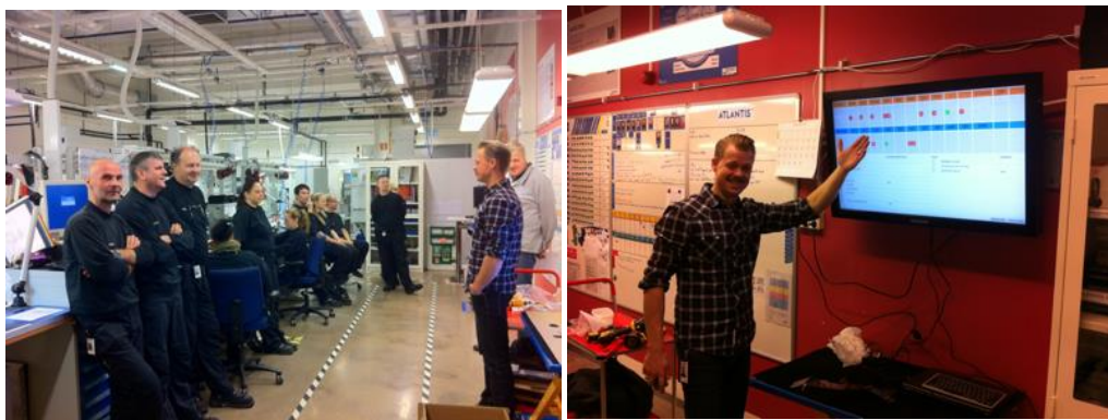
Figure 3. First prototype launched at Dentsply in 2012, (the updated software is still in use)

When starting a research project (with external funding) you have often already agreed on with your partners (potential client) of what you should do. Sometimes you encounter problems and need to change direction, however selling a product to a large organisation is something completely different than setting up a research project. You do expect long lead times, but you have not expected the lead times you get. Sometimes it seems to be all clear and then 3 months into the project the sponsor approaches you that they cannot pay the invoice since this was not run properly through the IT-department. At this point, some of our larger customers still regards our software as a prototype and treats it as a special case. There is a lot of creativity regarding how you should frame your product and service, both on the customer side, and on our side. It requires flexibility and the possibility to work for long times without being paid.