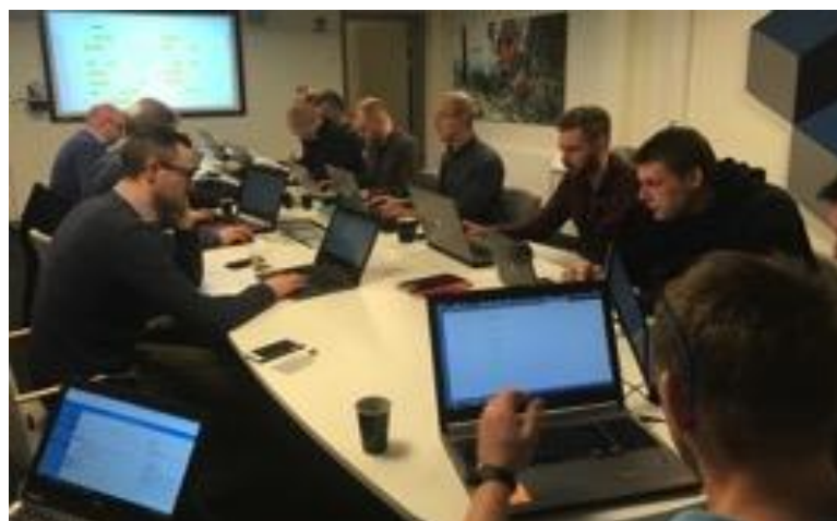
Figure 4. Training in Visual Planning Software, at Husqvarna (Spring 2019)

This is where it helps off to involve an external party (or people) like a university-based venture firm. You as a researcher have developed a methodology based on research. You have even managed to build the product, and as we did, managed to sell it to a couple of very large companies. However, we have no experiences in scaling, or selling to a lot of companies. The Yolean approach has, to this point been focused on serving the customers we have, and the ones that are interested enough to contact us and talk to us. However, the next step is to scale. This is where we will be able to build a mass market product. Have you ever tried to explain your research to someone that have no idea about what you are doing in a few catchphrases on a website or in a video clip? And then persuade them to pay for it? Even risk their future reputation for the sake of spreading your research. It does not matter if you can convince one person in an organization to buy your research. You have to help that individual convince his manager to put time into it. Not only their manager, but maybe a full board of different managers.