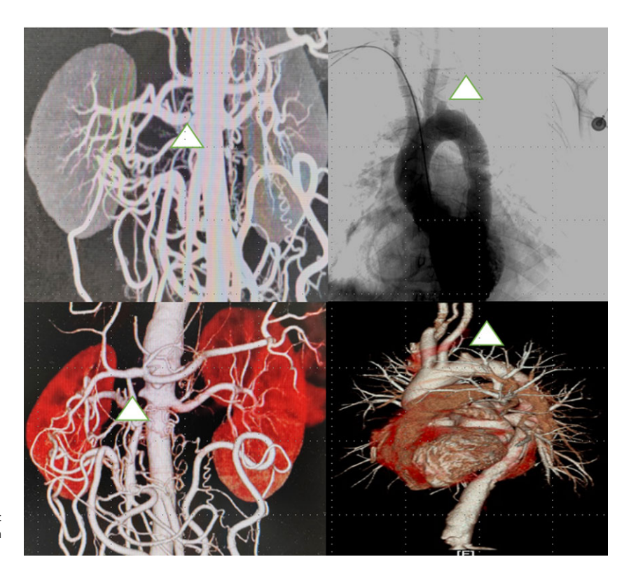
Figure 1. Right renal artery CT angiography and aortic angiography. Triangle showed the occlusion of the left subclavian artery and right renal artery.