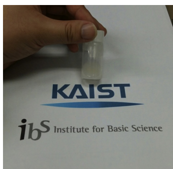
Figure 1. Digital image of vial glass containing PC-based electrolytes mixed with active material.