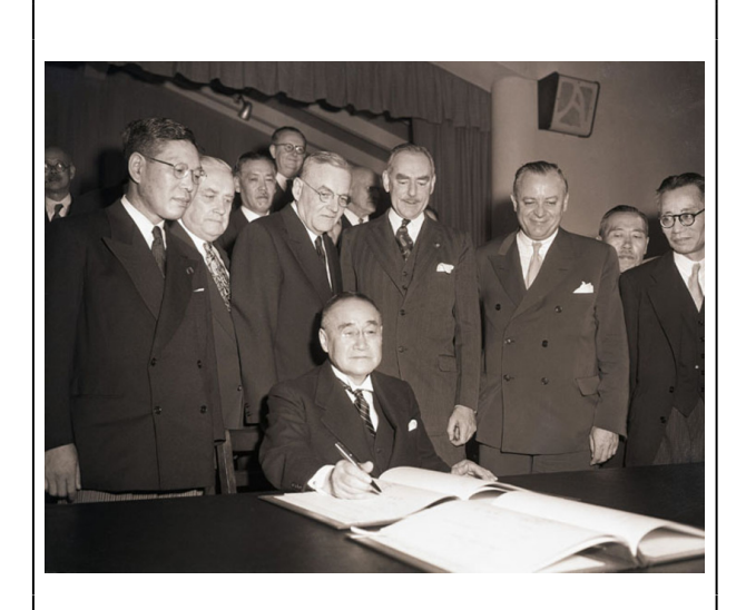
Prime Minister Yoshida Shigeru signs the US-Japan Security Treaty, March 8, 1951, with John Foster Dulles and W. Averill Harriman looking on.

accumulate and fester. The reason people can sustain an ordinary social existence is that methods do exist to recognize crimes, apologize for them, and make compensation. The situation at the state level is the same. In the case of twentieth century Japan, the Tokyo war crimes trial, the peace treaty of 1952, as well as the treaties and joint declarations with the Republic of Korea and the People's Republic of China were rites of passage for Japan's return to international society. These were possible only with the premise of making clear the responsibility of the leaders of the Asia-Pacific war and punishing them. However sloppy the proceedings at the Tokyo war crimes trial, to deny its outcome is to destroy the foundations of the restored international relations. If someone nevertheless ventures to do this, one cannot forget that the former victims would gain the right to retaliate.