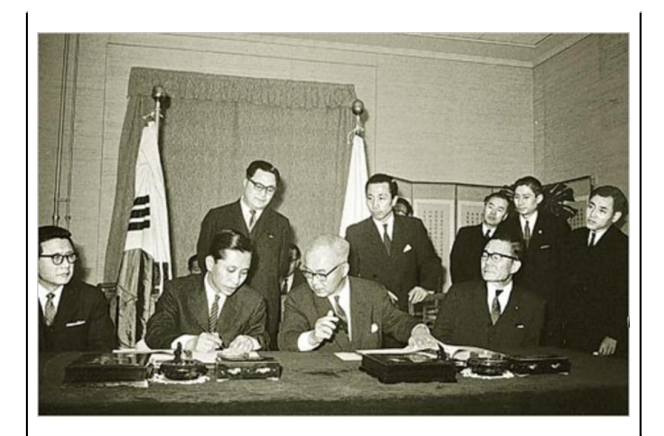
Korean Foreign Minister Lee Tong-won (left) and Japanese Foreign Minister Shiina Etsusaburo (right) sign the 1965 Treaty establishing ROK-Japan relations.

But has this in fact contributed to peace and stability in East Asia? Researchers have concentrated their attention on the harmful acts of Japan in the first half of the century, and have given scant attention to the self-restraint and the efforts on behalf of peace by Japanese in the second half of the century and in the new millennium. As a result, in neighboring countries, Japanese people today are often seen to be the same as the Japanese of the imperial era. They tend to be viewed as a constant threat. At the same time, not a few postwar Japanese people who have learned from experience and not once gone to war are surprised at this view from their neighbors and feel powerless to respond to this neglect of their own efforts at peace. Research into the history of the first half of the twentieth century was carried out with the expectation it would guarantee peace, but it is hard to say that it has contributed to reconciliation between the Japanese and their neighbors. Without efforts toward reconciliation on both sides, such research can in fact function to support further conflicts and bad feelings between Japan and its neighbors.