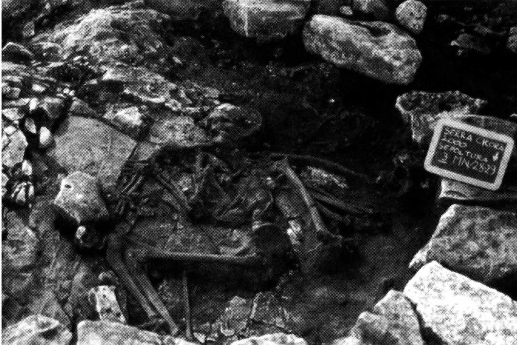
Figure 1 One of the dated individuals (T3 IND.A-Sect V) in one of the characteristic circular burials of Serra Cicora

For the preparation of the bone samples, a modified method by Longin (1970) was used to extract the collagen fraction (D'Elia et al. 2004; Gillespie et al. 1984). In particular, an additional alkali solution (0.2M NaOH for 30 min) was added before the collagen solubilization in hot water (85 °C), and acidified at pH = 3 with HCl for about 8 hr.