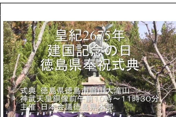
“Ceremony to Celebrate the 2675th Anniversary of the Foundation of the Nation in Tokushima” (Tokushima, Bizan Park, February 11, 2015).

continue to play an important role for advocates of a mytho-historical nationalism until today.