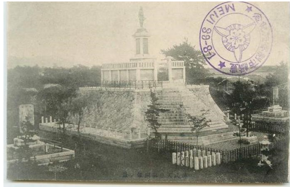
Monument of Jimmu Tennō in Toyohashi (built 1898, disassembled in 1945, the statue was restored in 1966).

to one of the supposed “forefathers” of the German(ic) nation, the chieftain Arminius (aka Herman the German), who had led a coalition of Germanic tribes to victory over a Roman army at the Battle of the Teutoburg Forest in 9 AD. In a similar way, in France statues to Vercingetorix, the celebrated opponent of Julius Cesar in the Gallic Wars (58-52 BCE), were erected around the same time.