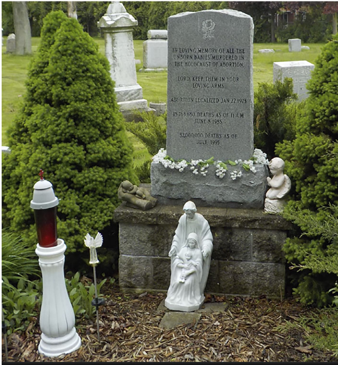
Figure 4. Grave of the unborn fetus (1973), Church of the Assumption Grotto.

and French origins. Interestingly, the grotto and the church grounds sit on a World War I and World War II German military cemetery.