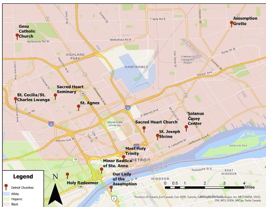
Figure 3. Map showing churches discussed in the text in relation to predominant race reported for 2010 census tracts. Census data downloaded from datadrivendetroit.org .