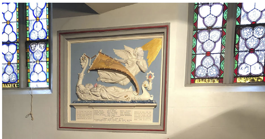
Figure 5. Holy Trinity Church.