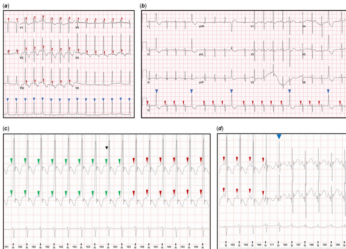
Figure 1. (a) Electrocardiogram on day 11 of life during initial neonatal outpatient showing a regular broad QRS complex rhythm with isorhythmic atrioventricular dissociation and T wave inversion across precordial leads. (b) Electrocardiogram at birth with baseline heart rate of 125 beats per minute and intermittent broad QRS complexes, absence of convincing preceding P waves and inverted T waves with a compensatory pause. (c and d) Holter monitoring on day 11 documenting a regular broad QRS complex rhythm with intermittently preceding P waves and short PR intervals with sudden resolution.

P waves and QRS complexes. These findings of a monomorphic broad QRS complex rhythm at 150 beats per minute (approximately 15% above preceding sinus rhythm) with isorhythmic dissociation in an asymptomatic neonate supported a diagnosis of an accelerated idioventricular rhythm.