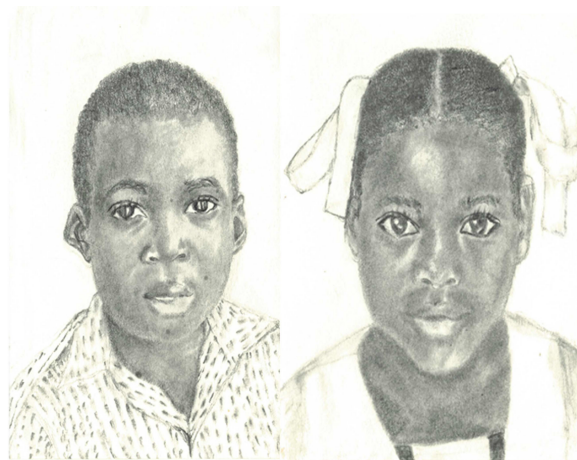
Figure A1. Sample stimuli from the Face-Name Binding Test (FNBT).

When designing the overall cognitive test protocol, we selected NEPSY-II subtests to assess the convergent and divergent validity of GLAMS subtests. Given the limited attention spans of preschool children, we prioritized subtests that were quick, simple to administer across various contexts (clinics, schools, homes) and considered culturally appropriate by Grenadian members of the study team. To assess convergent validity, we considered all of the preschool memory domain subtests from the NEPSY-II. There were concerns raised about the cultural familiarity and administration time/burden of the Narrative