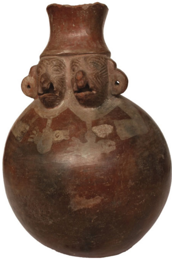
FIGURE 1 (Colour online) Effigy crock from the Chimú culture. Possibly representing conjoined twins with craniofacial duplication and cleft lip/palate.

which was held in Caxias do Sul, Brazil, in November 2013. The report and presentation of this case led us to review and write about this subject from a multidisciplinary point of view, taking into account iconographic, archeological, medical and genetic data.