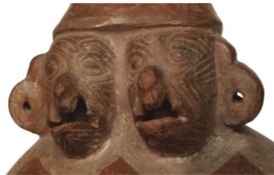
FIGURE 2 (Colour online) Detail of bilateral cleft lip/palate on the possible diprosopus twins represented on the Chimú crock.

The ceramic piece is representative of the early Chimú culture, which existed from 900 to 1470 A.D. in the north coast of Peru. This culture was the continuation of a previous civilization, the Moche. The capital, or political-administrative centre, of this civilization, the city of Chan-Chan, was the largest city in the world at that time; it was remarkable for being built entirely from adobe, and until