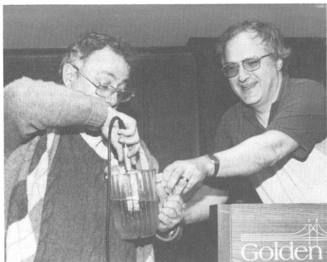
Northern California Section kicks off Spring Meeting on Sunday evening.