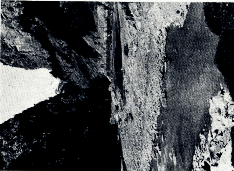
Fig. 1. The Gorge du Guil up-stream from La Chapele looking up-stream. Note the head of the late-glacial fan under the meadow