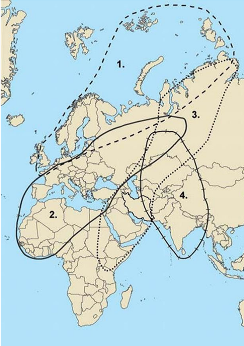
Figure 1. Main geographical populations of Anatidae in western Eurasia: 1. Northern White Sea/North Sea population, 2. European Siberia/Black Sea-Mediterranean population, 3. West Siberian/Caspian/Nile population, and 4. Siberian-Kazakhstan/Pakistan-India population (Isakov 1967, Boere and Stroud 2006). Iran (solid borderlines) is located within the Western Siberian/Caspian/Nile flyway.

winters in Iran. Other globally threatened species regularly occurring in Iran include Marbled Teal Marmaronetta angustirostris (VU), a breeding and wintering visitor (Scott and Rose 1996, Kaboli et al. 2012) and Lesser White-fronted Goose Anser erythropus (VU), another common winter visitor (Mansoori and Amini 2011, Kaboli et al. 2012). Anatidae species that are recorded as vagrants in Iran include Bean Goose Anser fabalis , Red-breasted Goose Branta ruficollis , Barnacle Goose B. leucopsis , Light-bellied Brent Goose B. hrota , Cotton Pygmy-goose Nettapus coromandelianus , Long-tailed Duck Clangula hyemalis , Common Scoter Melanitta nigra , and