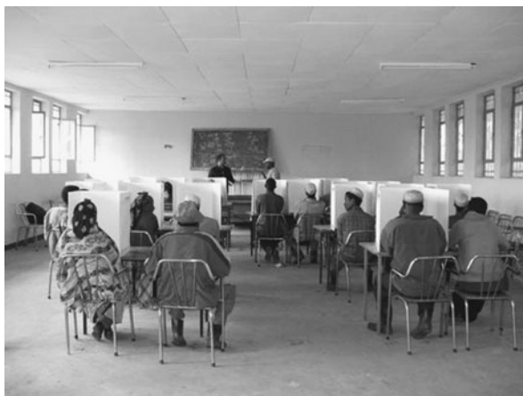
Fig. 2 Typical experiment session

Second, in order to maintain a high degree of experimenter control, particularly over the explanation that was provided to subjects, the following measures were taken as per the norm in laboratory-like experimental sessions conducted in developed countries: (1) one of the authors served as the experimenter and the other author served as the assistant experimenter, (2) the same experimenter and assistant experimenter conducted all sessions and (3) since the experimenter did not speak the subjects' national language, Amharic, all sessions were conducted in English with live translation by a translator who also stayed constant across all sessions. This translator was trained on the protocols prior to the first session. This afforded the authors full control over the explanation of the game protocol that was given to the farmers, and full information on any questions that arose from the subject pool. It also allowed for a meaningful evaluation of subjects' understanding.