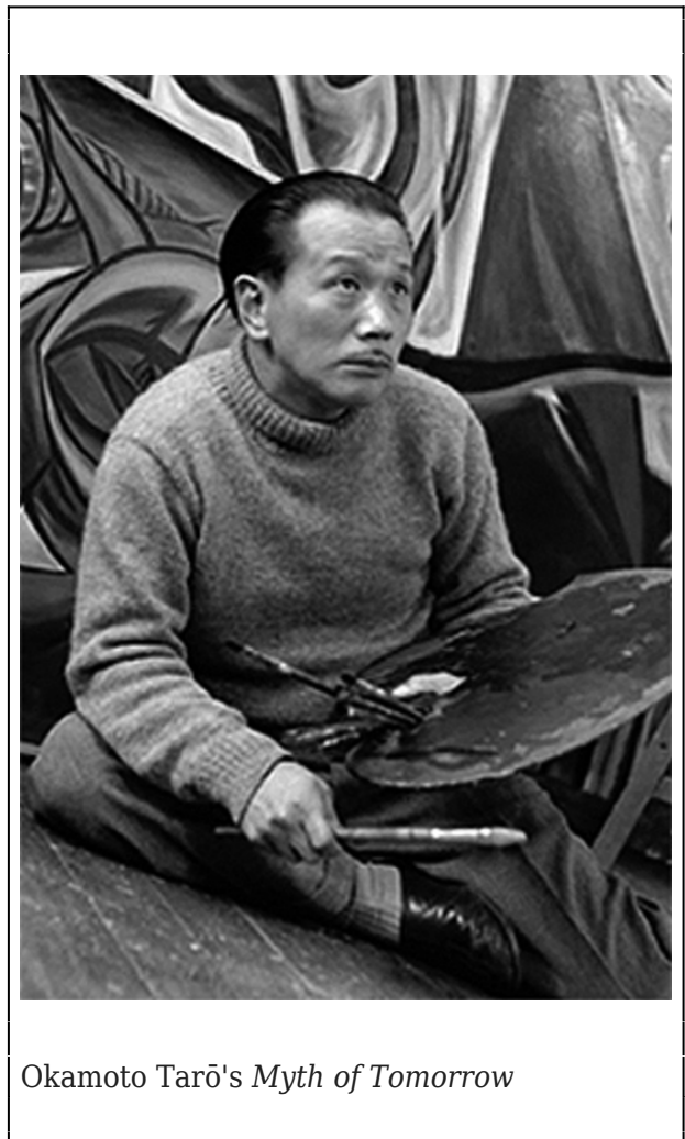
Okamoto Tarō's Myth of Tomorrow

Fair's theme of "progress and harmony" ( shimpo to chōwa ). Chim ↑ Pom's intervention, I argue, exposes the connection between the dream of a peaceful, nuclear-powered, high-growth economy and the reality of Japan's continued economic and military dependence on the United States. By juxtaposing their own work with Okamoto's mural in "real-time", Chim ↑ Pom help us to recognise the connection between Fukushima and Hiroshima and the hidden histories of nuclear power which have unfolded under the American "nuclear umbrella".