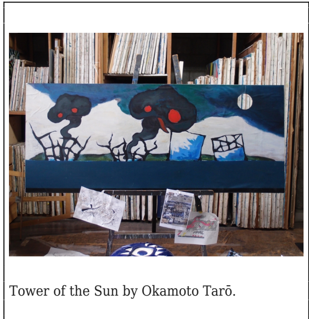
Tower of the Sun by Okamoto Tarō.

logic of the pavilion which he saw represented in the soaring roof of the pavilion. His Tower of the Sun proposed an alternative vision of "life" as the primitive energy of humanity which is neither progressive nor harmonious. 43