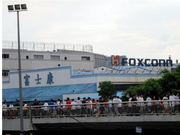
Foxconn workers flood in and out of the Longhua factory in Shenzhen, Guangdong. Hon Hai Precision Industry Company, known by its trade name Foxconn, is headquartered in Taipei.