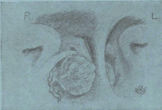
Right Antral discharge seen by Endo-Rhinoscope (DR P. WATSON-WILLIAMS' CASE)

This Endo-Rhinoscope affords an excellent upright view of the regions under inspection; it gives a very wide field and shows the details clearly and in true colour