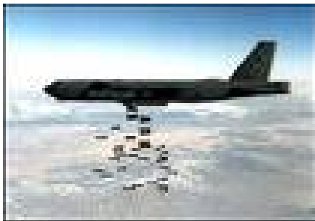
B-52 bombing of North Vietnam

From Dec. 18 until Dec. 30 in 1972, the United States conducted a campaign of intensive aerial bombing, using massive B-52s, over North Vietnam. In the approximately 4,000 sorties flown in what was termed Operation Linebacker II, American pilots concentrated on the major cities of Hanoi and Haiphong. The missions executed so-called area bombing, never precise or pinpoint. Their goal: To kill as many civilians as possible.