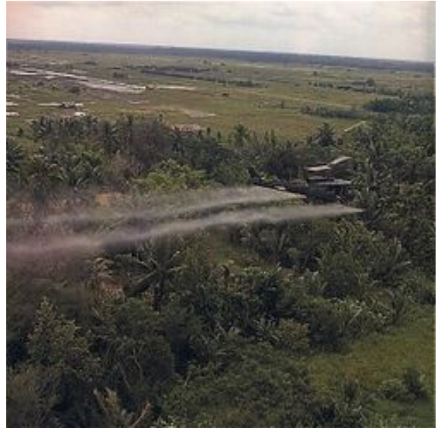
A UH-1D helicopter on defoliation mission in 1969