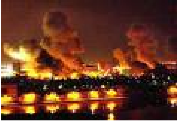
Baghdad in flames