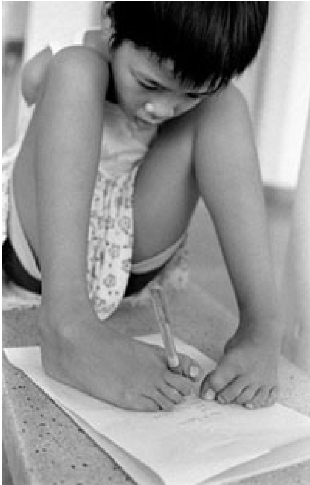
Vietnamese Agent Orange Victim

Agent Orange, so called because of the orange stripe on the drums in which it was stored, was a powerful herbicide and defoliant. More than 72 million liters of Agent Orange were sprayed over Vietnam. The cruel thing about this highly toxic chemical is that its effects reach forward across the generations. Vietnamese children born with birth defects now are the grandchildren of men and women who were victims of the spraying in the 1960s.