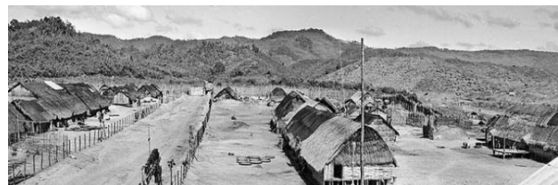
Strategic Hamlet, Vung Tau District,

Elements of Japanese seized hearts methods also recurred in South Vietnamese counterinsurgency in the 1950s and 1960s. In 1961, British managers of the counterinsurgency system in Malaya went to Saigon to consult with President Ngô Đình Diệm on hearts and minds tactics against insurgency in the Republic of Vietnam. From this visit and the subsequent British advisory mission to Sai Gon, several historians have concluded that South Vietnamese hearts and minds counterinsurgency, which included clearance, hold, protection, and persuasion of population relocated into new fortified villages, known now as strategic hamlets, was a direct descendant of British hearts and minds counterinsurgency in Malaya. However, President Diệm and his senior advisors had their own ideas about hearts and minds counterinsurgency well before the British mission arrived in Sai Gon. 55 There is reason to think that Diệm was probably aware of Japanese seized hearts counterinsurgency well before he became prime minister of the State of Vietnam in 1954 and then president of the Republic of Vietnam in 1955. As a nationalist and anti-Communist, Diệm felt a sense of alliance with some of the political elements of the Imperial Japanese Army and Japanese diplomatic mission in French Indochina in the early 1940s, men who were vigorously opposed to Communism, committed to some form of independence for Vietnam, and under orders to persuade Vietnamese to cooperate with the Empire of Japan. 56