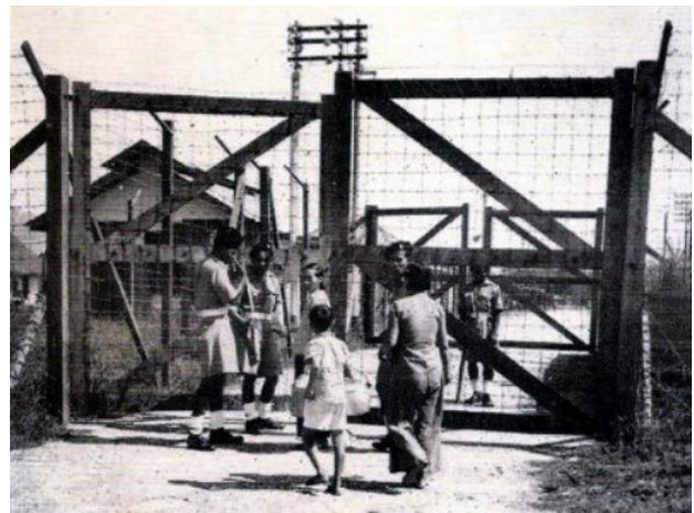
Security gates at a New Village, 1950s, Malaya.

and over the course of several secret meetings with representatives of the Malayan People's Anti-Japanese Army in 1943 and 1944, collected comprehensive intelligence about imperial Japanese counterinsurgency strategies, including evidence that seized hearts tactics were effective in countering the activities of the Malayan People's Anti-Japanese Army. SOE intelligence on Japanese operations in Malaya then went to British South East Asia Command, to London and New Delhi, and was available to the British after they re-occupied Singapore and Malaya. 45