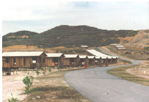
A FELDA resettlement village, Pahang, Malaysia 1970s

After merdeka in 1957 and final creation of Malaysia (without Singapore) in 1959, the Malay managers of the new state also thought so highly of the New Village program that they recreated elements of it as a way of regulating Malaysia and making it more legible as a modern state. Until its conversion into a state manager of agribusiness in 1991, the Federal Land Development Authority (FELDA) created, administered and managed a vast relocation and resettlement scheme in peninsular Malaysia.