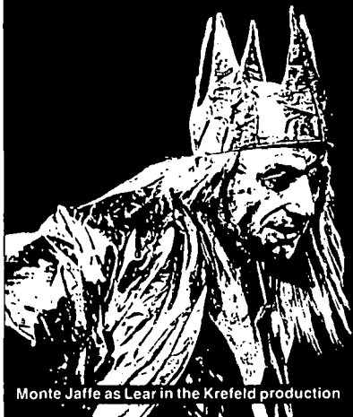
Monte Jaffe as Lear in the Krefeld production

Box Office 01-836 3161 Credit cards 01-240 5258