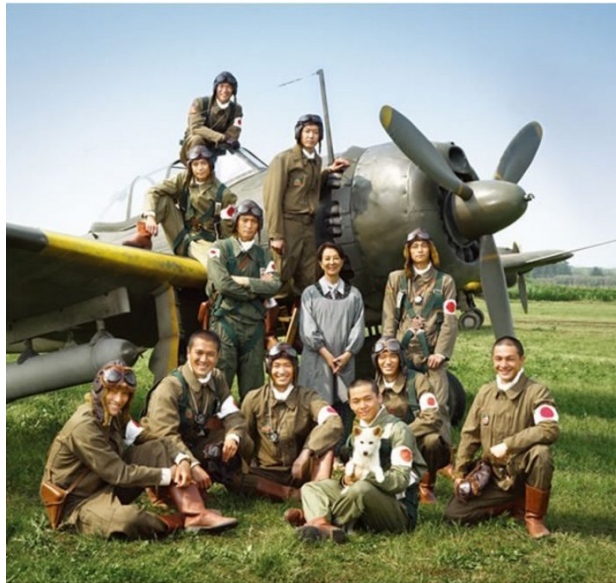
Promotional photo of the cast of "Ore wa, kimi no tame ni koso shini ni iku" (a literal translation of which is I will go to die for you above all), the controversial 2007 movie about a World War II kamikaze pilot written and produced by Ishihara.

famously in the 1989 polemic he wrote with Sony CEO Morita Akio, The Japan That Can Say No , a high-handed claim of Japanese superiority. He continues to offend China with his occasional use of the derogatory term "Shina" from the Japanese imperial era.