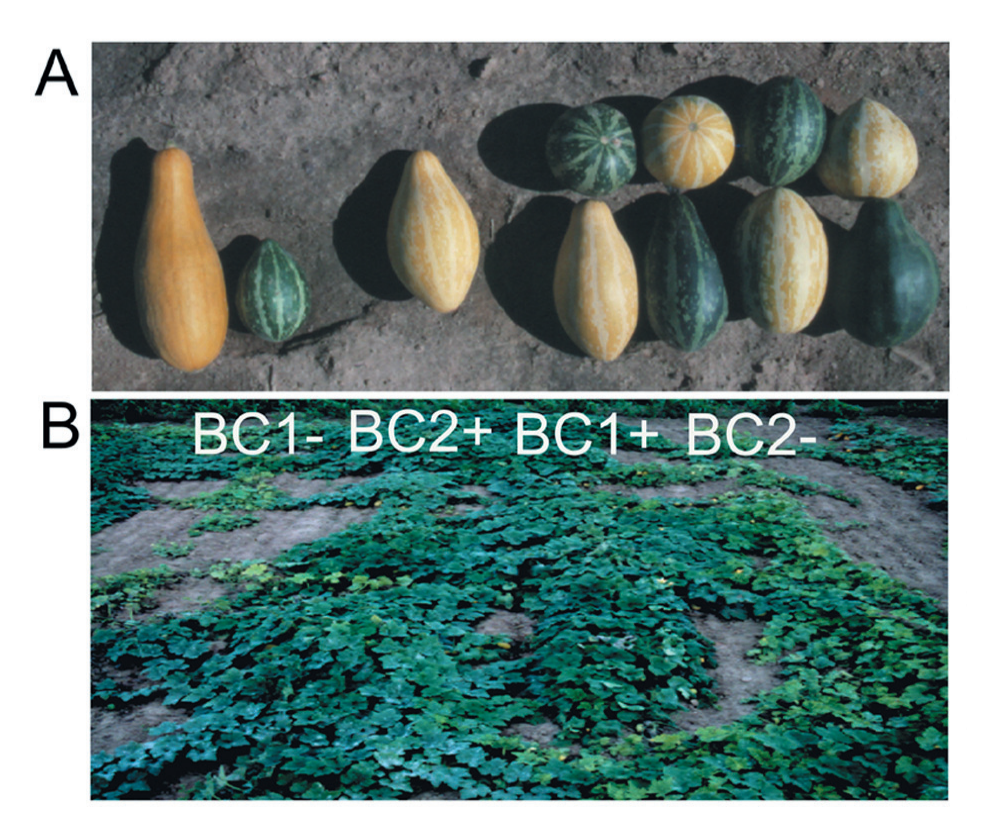
Figure 1. Shoot growth and fruits of C. texana and C. texana × CZW-3 hybrids. (A) Eight distinct fruits of BC1 hybrids (extreme right) are compared with one fruit of CZW-3 (extreme left), C. texana (second to the left), and F1 hybrids (third to the left). (B) Vigor of nontransgenic BC1 (extreme left row) and BC2 (extreme right row), and transgenic BC1 (central right row) and BC2 (central left row) hybrid segregants under conditions of high disease pressure of CMV, ZYMV, and WMV. (This figure is available in color in electronic form at www.edpsciences.org/ebr).