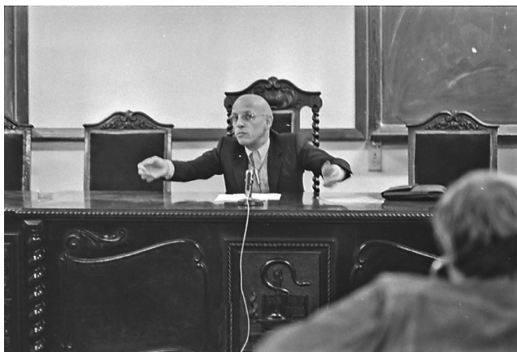
Figure 11.2 Michel Foucault lecturing at the Instituto de Medicina Social.