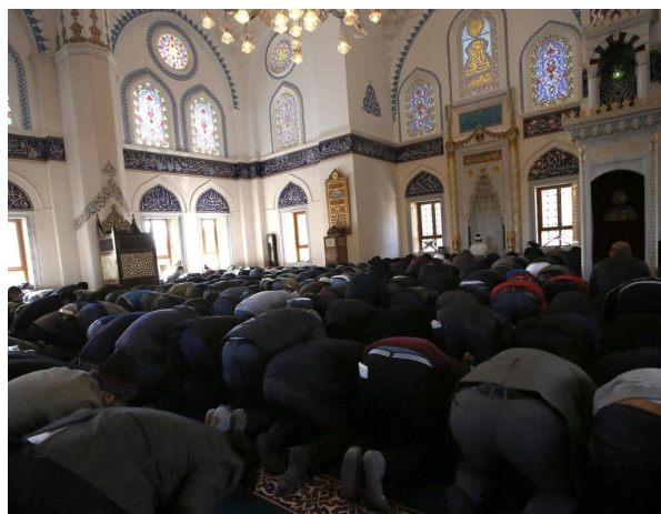
Muslims pray in Tokyo mosque

According to the court, the Tokyo Metropolitan Police launched their campaign with the formation of a “mosque squad” composed of forty-three agents in June 2008. The leaked documents showed that police stationed agents at mosques, followed individuals to their homes, obtained their names and addresses from alien registrations, and compiled databases profiling more than 70,000 individuals. The documents also showed that the police obtained bank account information, including balances, income and expenses, and other personal information and stationed agents at Islam-related non-profit organizations, halal shops and restaurants, and other places that might be frequented by members of Tokyo’s Muslim community. In some cases, the police actually installed surveillance cameras at mosques and other venues.