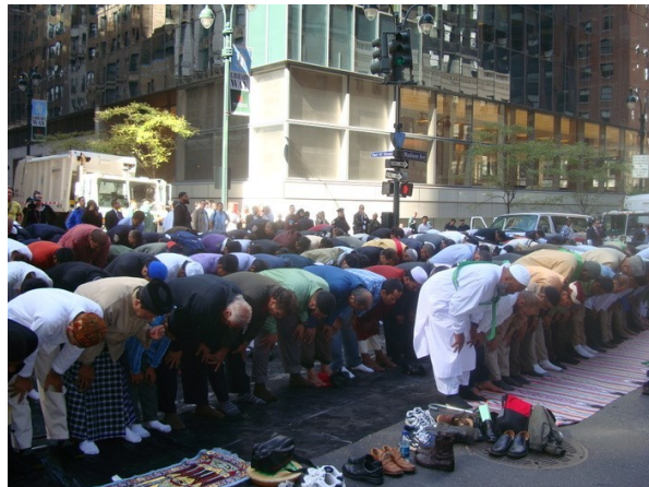
Muslims gather for prayer in New York City streets

One year after the New Jersey suit was filed, a separate action was filed in federal district court in Brooklyn on behalf of Muslim residents of New York City. Named defendants included then-Mayor Michael Bloomberg and Chief of Police Raymond Kelly. The plaintiffs included a community college student who organized a food program infiltrated by an undercover police agent and the imam at a mosque who said he was repeatedly questioned by undercover police officers. Both men, Muslim residents of Brooklyn, claimed that fear of the presence of undercover police forced them to reshape their words and actions in order to avoid potential conflict or misunderstanding by police informants and drove potential members away from their groups.