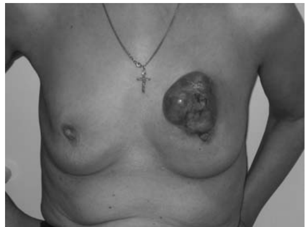
Figure 1. Lump protruding from the upper quadrant of the left breast.

The final histological classification was a multi-centered right-sided carcinoma (4 cm) (pT2 (m) pN0 (0/15) L0, V0, G2, R0). On the left side was an 8 cm carcinoma (pT4b, pN0 (0/14), L0, V0, G2, R0). The excision was histologically complete. The regional lymph nodes (15 on the right, 14 on the left) were negative on histological examination. As they were clinically highly suspicious, the tissue was sent for a second opinion at a histology reference center, where immune histochemistry was used to confirm the nodal negativity for any form of invasion. Follicular lymphatic hyperplasia of non-specific origin (Fig. 3) was reported. To exclude distant metastases, a chest X-ray, CT neck and thoracic inlet,