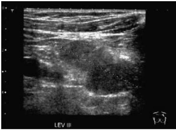
Figure 2. Ultrasound image of pathological lymph nodes in level 3 left.