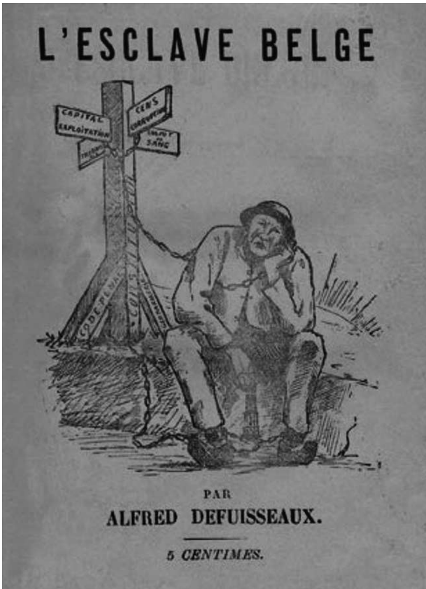
Figure 1. "L'esclavage ouvrier", pamphlet written by Alfred Defuisseaux.

stressed in the aristocracy, that is to say, it applied to the bourgeoisie–workers opposition the binomials “idle–productive”, “egoism–generosity”, “exploiters–exploited”, or “tyrants–slaves”. For La Justicia Humana , “capital is the feudal castle of the modern bourgeoisie”; the bosses are “parasites”, “idle blood