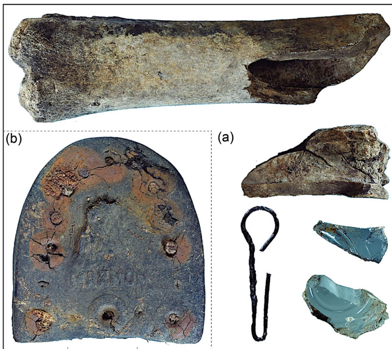
Figure 5. Finds uncovered at the base of the Taavetti Lukkarinen hanging-tree. (a) The bone and the finds concealed inside it; (b) The shoe sole that capped the bone deposit. (Illustration: Emilia Jääskeläinen. Ikäheimo & Äikäs 2018, 102.)

have been an important and valued sacrificial item throughout much of the history of the Sámi sieidi , attested by sources since the sixteenth century (Olaus Magnus [1555] 1998). While the boulder at Hyljelahti is not a sieidi , this comparison helps to put the site in a broader historical context of northern human–environment relations, instead of regarding it merely as an isolated curiosity.